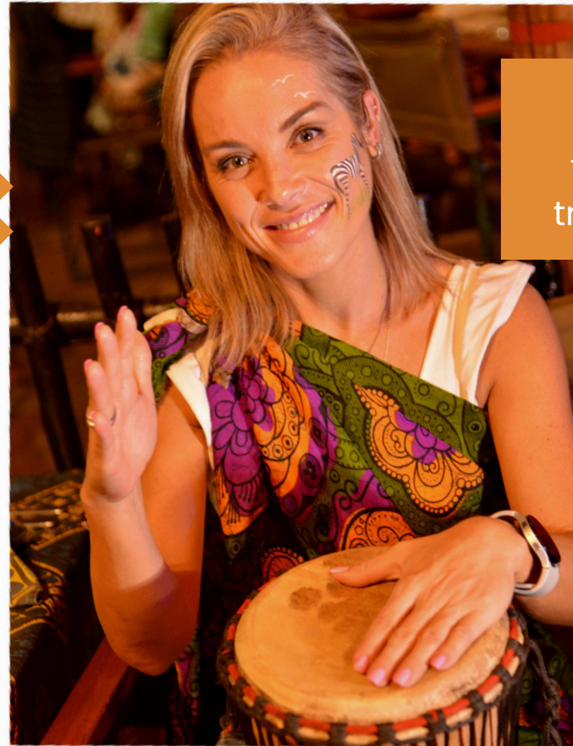
BOMA traditional buffet, traditional dancing